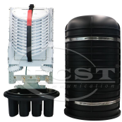
Fiber Optic Splice Closure