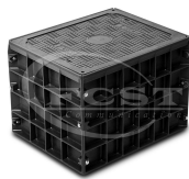
Telecom Manhole Chamber